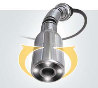
swappable heads The pan/tilt camera detaches from the 360, allowing an optional self-leveling axial camera to be attached for pipes down to 2".